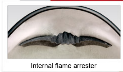
Internal flame arrester