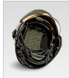
Adjustable antistatic net cradle

External Knob for size adjustment system (patented). No interference with neck protector. Easy to use even when wearing firefighting gloves. The required setting can be changed depending on the operation (tight for extreme situation, looser in less dangerous conditions).