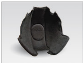
Lining with comfort soft pad (detachable washable and replaceable)