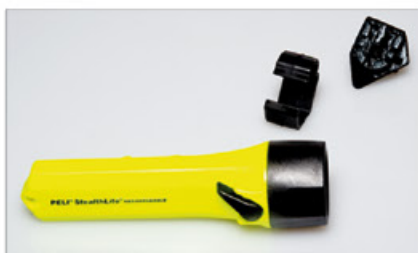
Torch holders support (detachable)

third party in systems supported (on request)