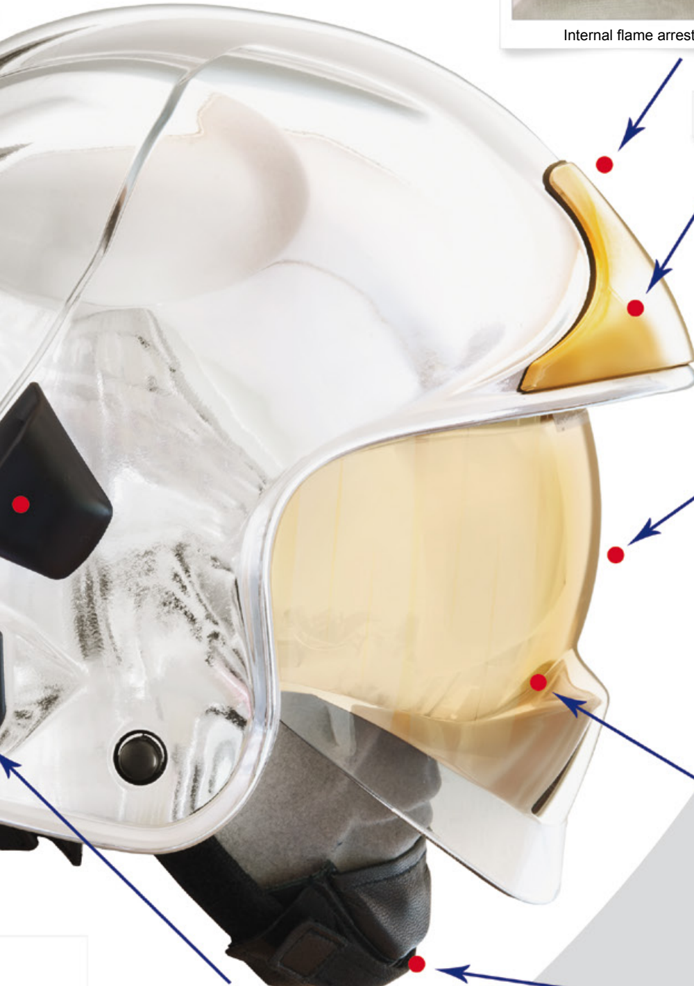
OPTION Golden front plate (personalized on request)

Integrated and swivel eye shield (depending on model) with grip tab both side, OPTICAL CLASS 1 with ultraviolet protection and resistant to: